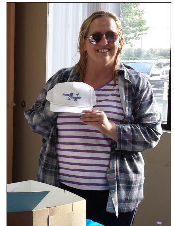
Employees gather at Phoenix, Carson and Wilsonville terminals to socialize, enjoy lunch and receive giveaways during Employee Appreciation Week.