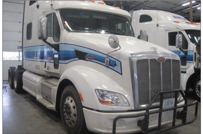
During the past six months, nearly all Marten tractors have been updated with Grill Guards. The guards help protect against debris getting caught in the steer tire during collisions.

Along with equipping grill guards on all our tractors, we continue to outfit all new tractors with "Collision Avoidance Systems". These have been two very successful programs in keeping our drivers safe and productive. Look for more information about Collision Avoidance Systems in the next Transporter.